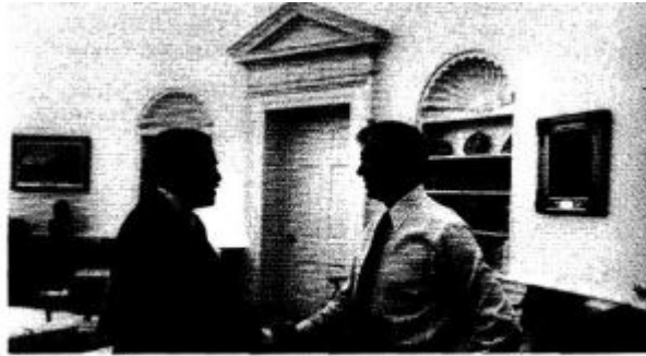
President Jimmy Carter expresses his appreciation to author for his key role in the exfiltration operation.