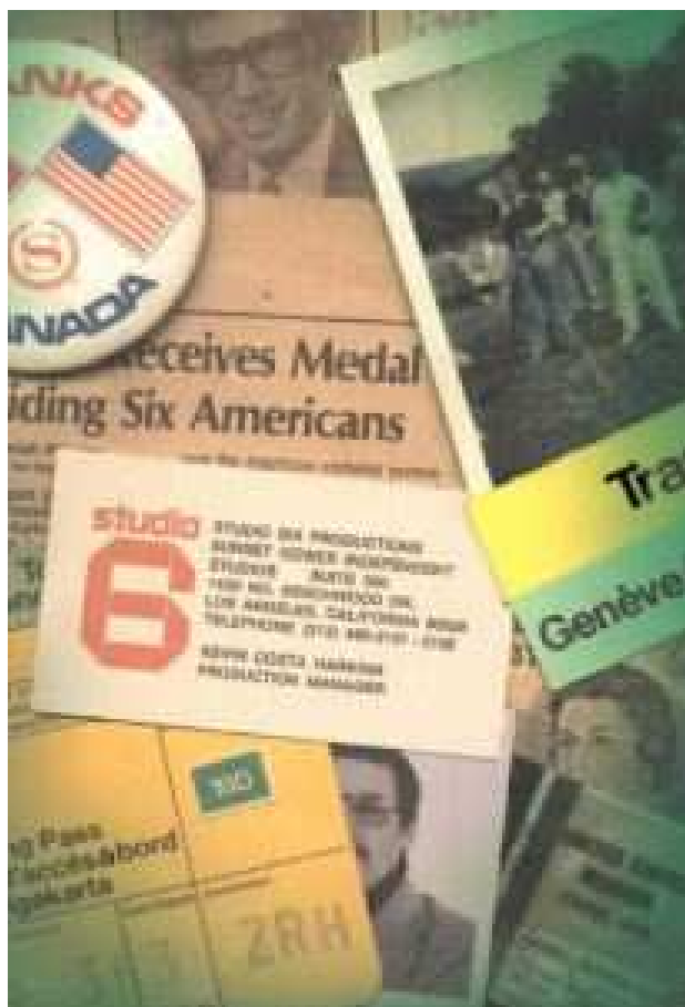
Artifacts published with the CIA account.

According to the CIA's account, "The Mafia and many shady foreign investors were notorious for backing productions in Hollywood," so it was the perfect spot for the CIA to operate. The team opened Studio Six Productions and set up shop in offices previously used by Michael Douglas during production of The China Syndrome . Picking a script was a bit tricky. They decided, "We needed a script with 'sci-fi', Middle Eastern, and mythological elements. Something about the glory of Islam would be nice, too." The crew found one that would work at the bottom of the pile; it was based on "an award-winning sci-fi novel" ( Roger Zelazny's Lord of Light ). They drew up some logos and posters and bought full-page ads in Variety and the Hollywood Reporter . The origin of the title Argo stemmed from "a profane 'knock-knock' joke": Argo who? Argo fuck yourself.